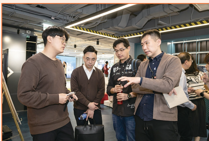
初創企業與房協同事在房地產科技共享工作室交流。 A start-up interacts with HS colleagues at PropTech co-working space.