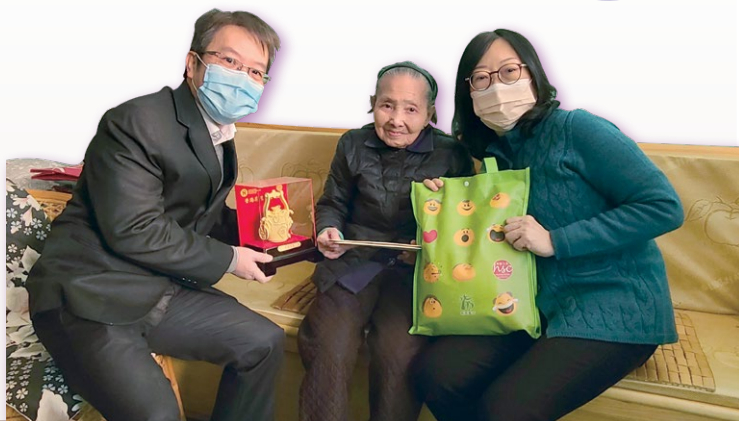
房協屋邨經理向過百歲長者住戶致送禮物和生日祝賀，祝福他們身心康泰。 Housing Society estate managers sending birthday gifts and blessings to the centenarians, wishing them good health and longevity.

Centenarians are becoming more common in Hong Kong. Every year, the Chairman of the Elderly Commission and the Secretary for Labour and Welfare pay tribute to the centenarians in Hong Kong by sending them birthday greetings. To complement this occasion, the HSC and estate managers brought along golden medals and gift packs to visit the centenarians living in the Housing Society's rental estates, offering their best wishes, and learning from them the secrets to health and longevity.